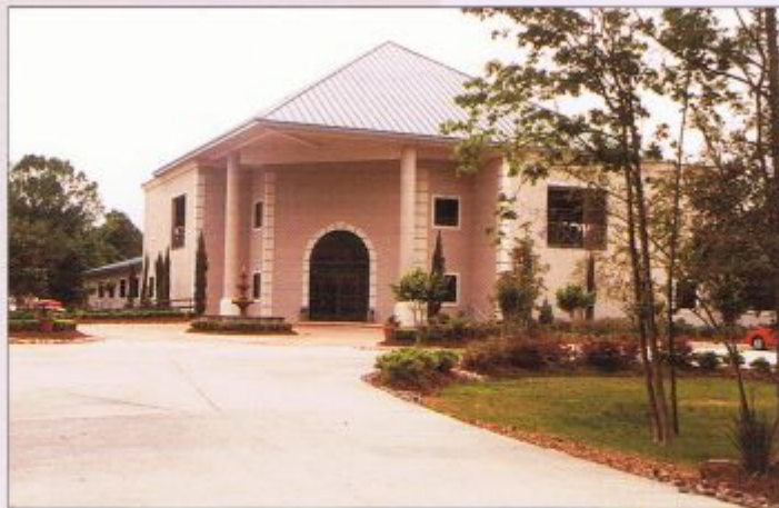
The Shaw Office Building was a project Toney Construction Services performed from the ground up. Work included a retention pond, all necessary site work, metal framing, stucco, custom glass and high end millwork, and interior finishes.

TCS's list of clientele is an impressive one. TCS has worked with AT&T, Kellogg Brown & Root, Caldwell Watson, Chelsea Catering, Continental Airlines, Conoco, Convergys, ExxonMobil, Frito-Lay, Hydriil Corporation, Miller Building Corporation, Shell,